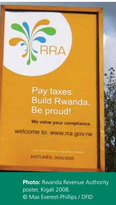
Photo: Rwanda Revenue Authority poster, Kigali 2008.