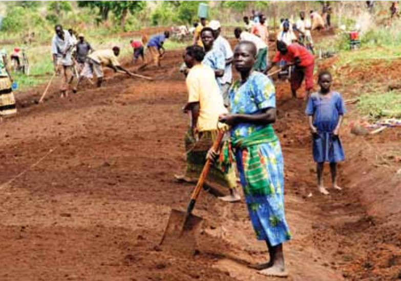
Photo: Community road-building in northern Uganda. © Steve Ainsworth / DFID

While there are many examples of the contributions of citizen engagement to building responsive states, these do not always occur. In other examples, engagement can lead to elite capture, clientelism and patronage , or increased frustration of those involved. Moreover, the types of strategies and outcomes that can be expected vary a great deal according to context. 158 Yet these are dependent in turn, on a combination of the forms of mobilisation used and the political contexts in which they occur. In fragile states or emerging democracies, associational forms of citizen mobilisation may contribute most importantly to the constructing of