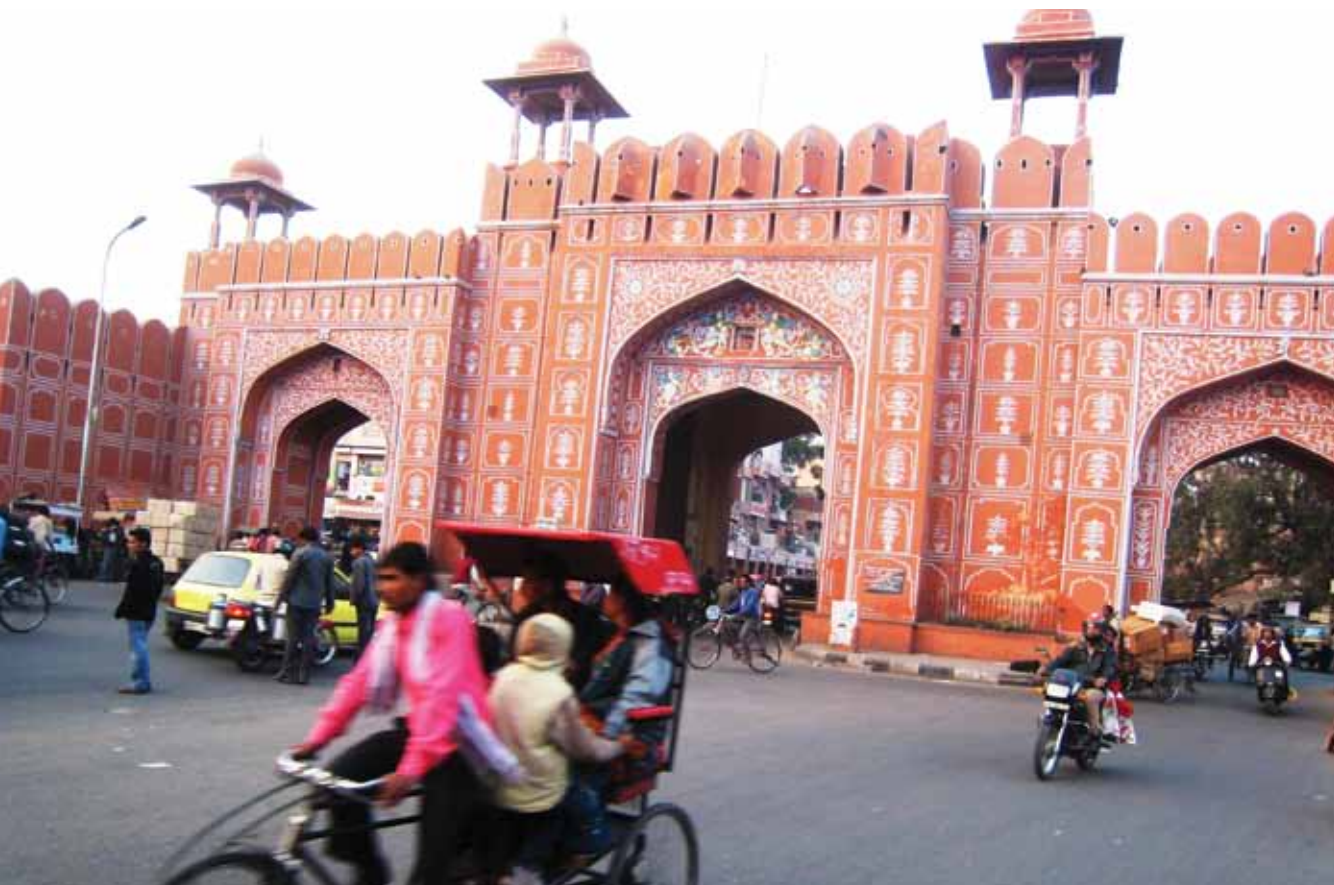
Photo: Jaipur, India, December 2009.

in some countries, such as Zambia, through political parties. 29 However, in the absence of parties with clear programmes, or formal or informal requirements for inclusivity, elections may not be an effective vehicle to achieve lasting elite bargains. 30 In countries like Ghana, an informal convention has meant that the presidents have generally included people from the major regions and ethnic groups in their governments. 31 More formal provisions for inclusive government are in place in Nigeria, where the ‘Federal Character Principle’ informs appointments to ensure that major groups participate in power. 32