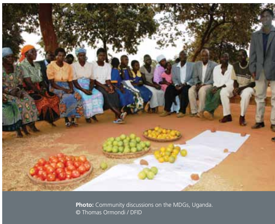
Photo: Community discussions on the MDGs, Uganda.

The way services are reorganised or delivered clearly affects opportunities for collective action . This underlines the need to understand the impact of all public policy interventions on the ability and incentives of different groups to mobilise. For instance, the existence of the private licence-holder in the case of the Public Distribution System for providing subsidised food grain enabled public officials in Delhi to demand better performance without publicly criticising their own colleagues. 184 In Mexico, the central government, as well as many state-level governments, have formal agreements with social organisations to collaborate on the design and implementation of social policy. Chief among these collaborations is reproductive health policy, in which NGOs and the government would work together to improve services and breadth of coverage. The Inter-Institutional Group on Reproductive Health gave the women's movement in Mexico privileged access to forums for policy design and monitoring. As a result of the strong relationships between public institutions and NGOs, many of the services provided and advocated by the NGOs have since come under government remit, representing a successful use of social accountability for positive policy change. 185