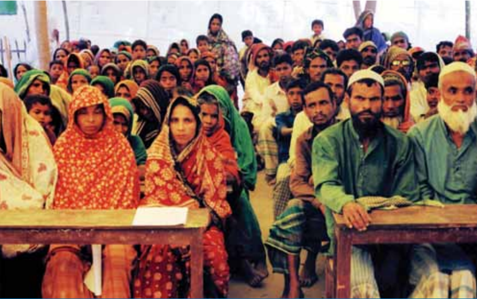
Photo: Bangladesh adult education class.

Recognise that citizenship can be exclusionary as well as an inclusive.