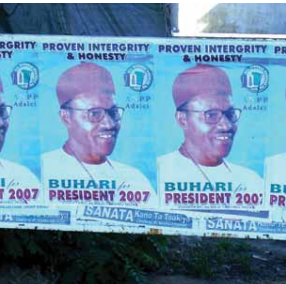
Photo: Campaign posters for the 2007 Nigerian presidential elections.

significant political and financial autonomy. The aim of decentralisation is usually to bring government closer to the governed. Local governments might appear to be inherently more accountable to their constituencies than regional or national governments. But the evidence shows that decentralisation – widely practiced since the 1990s – has had a considerable variety of outcomes. 132