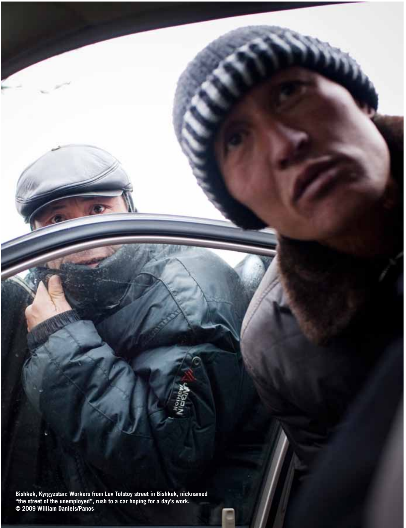
Bishkek, Kyrgyzstan: Workers from Lev Tolstoy street in Bishkek, nicknamed "the street of the unemployed", rush to a car hoping for a day's work.