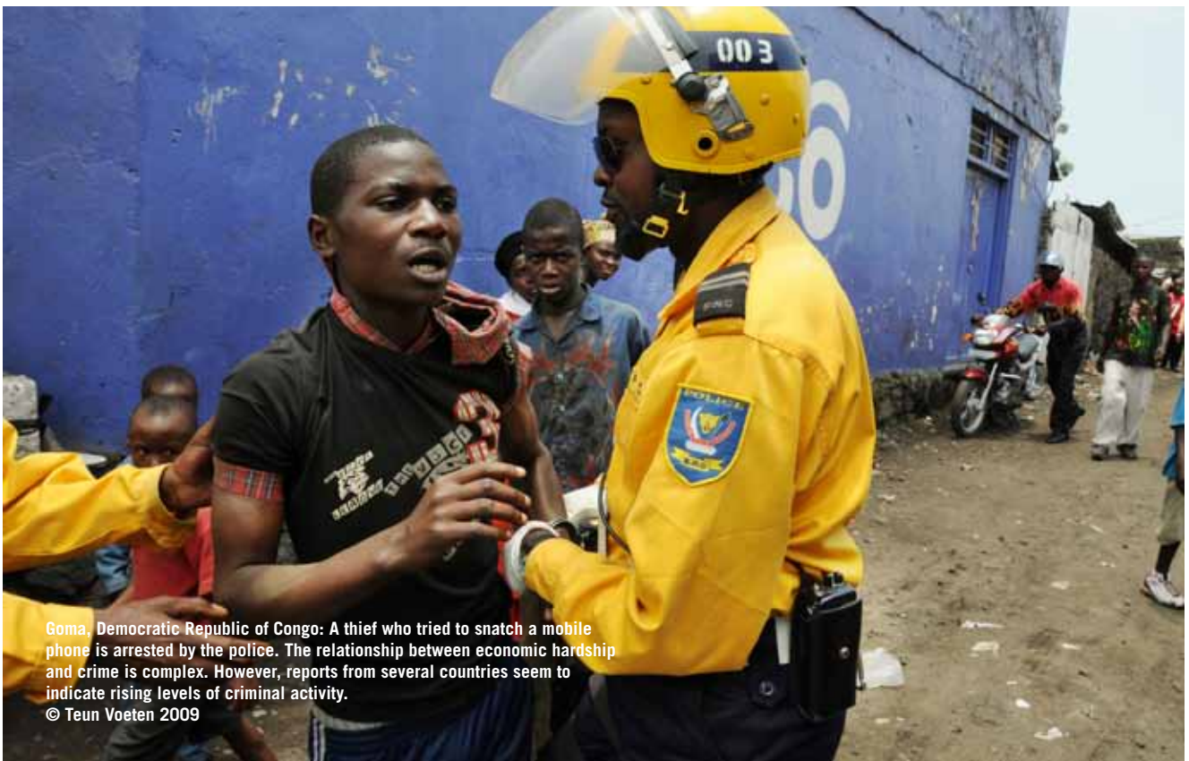
Goma, Democratic Republic of Congo: A thief who tried to snatch a mobile phone is arrested by the police. The relationship between economic hardship and crime is complex. However, reports from several countries seem to indicate rising levels of criminal activity.