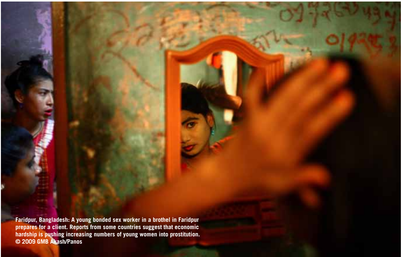
Faridpur, Bangladesh: A young bonded sex worker in a brothel in Faridpur prepares for a client. Reports from some countries suggest that economic hardship is pushing increasing numbers of young women into prostitution.