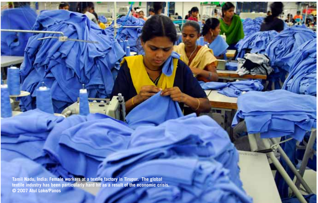
Tamil Nadu, India: Female workers at a textile factory in Tirupur. The global textile industry has been particularly hard hit as a result of the economic crisis.