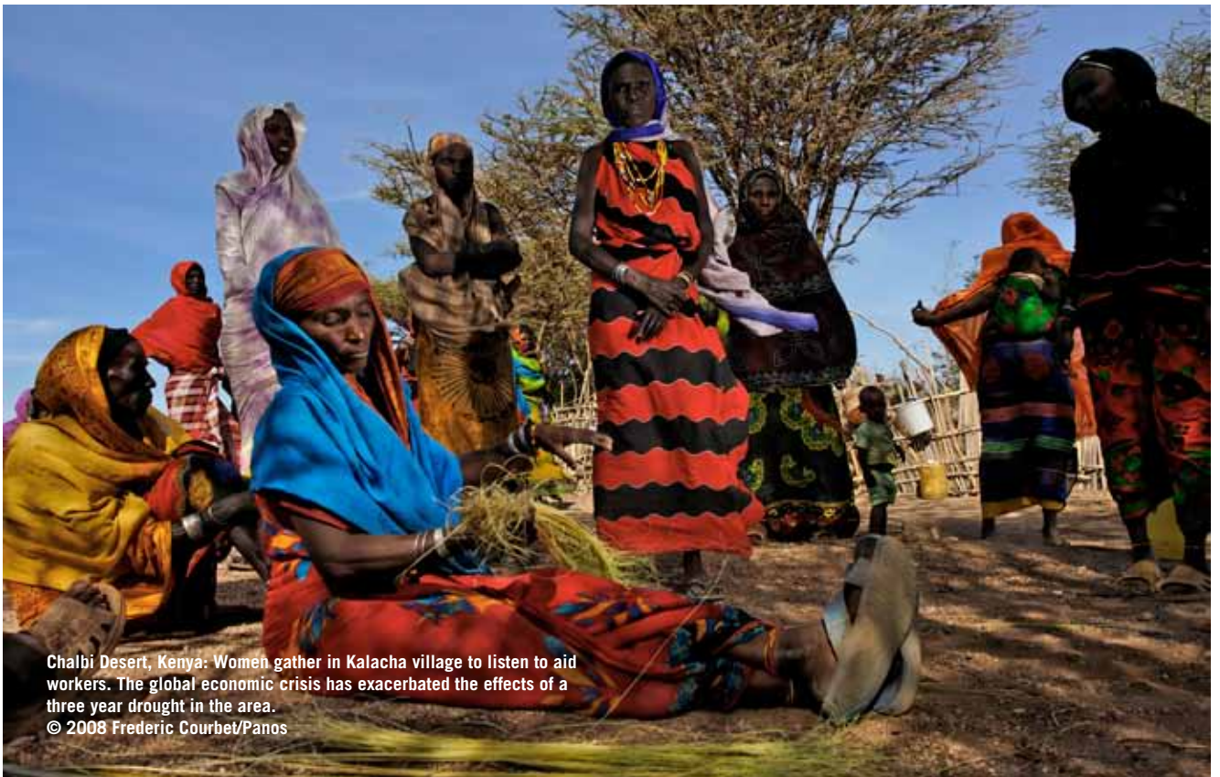
Chalbi Desert, Kenya: Women gather in Kalacha village to listen to aid workers. The global economic crisis has exacerbated the effects of a three year drought in the area.